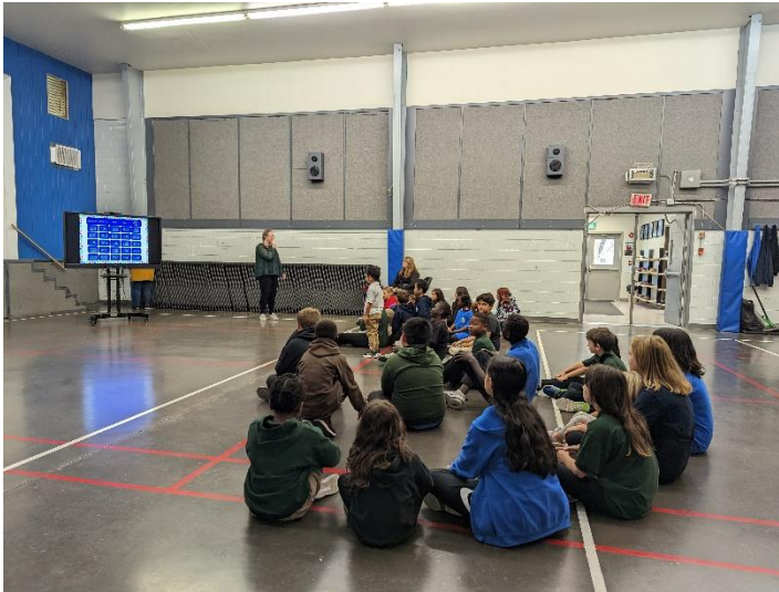
RSCS Assembly Bible Jeopardy Fall 2022