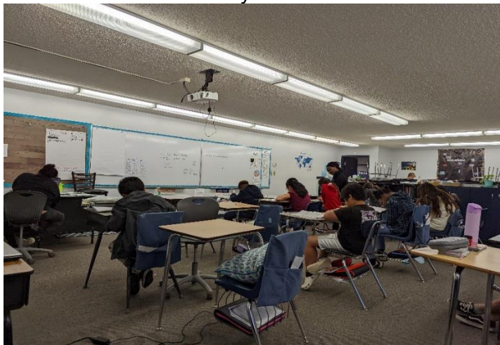
CHCS Grades 5-7