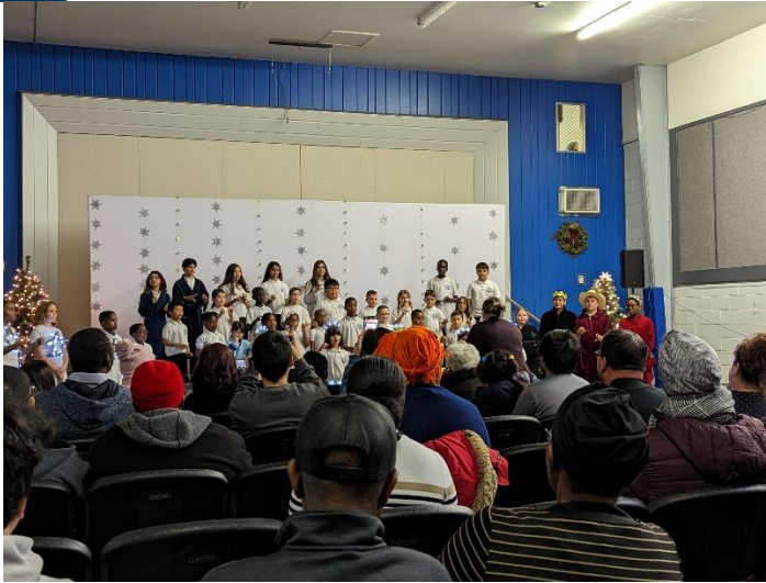
RSCS Christmas Concert 2022