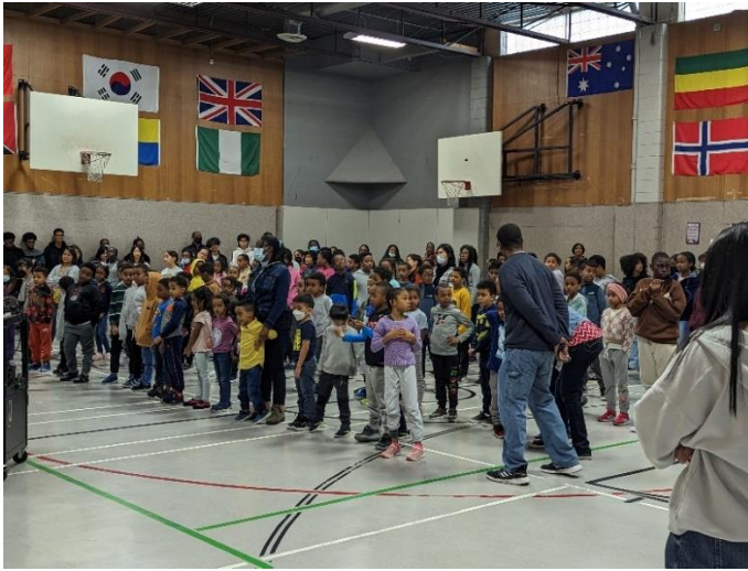
PCAA Assembly March 3, 2023